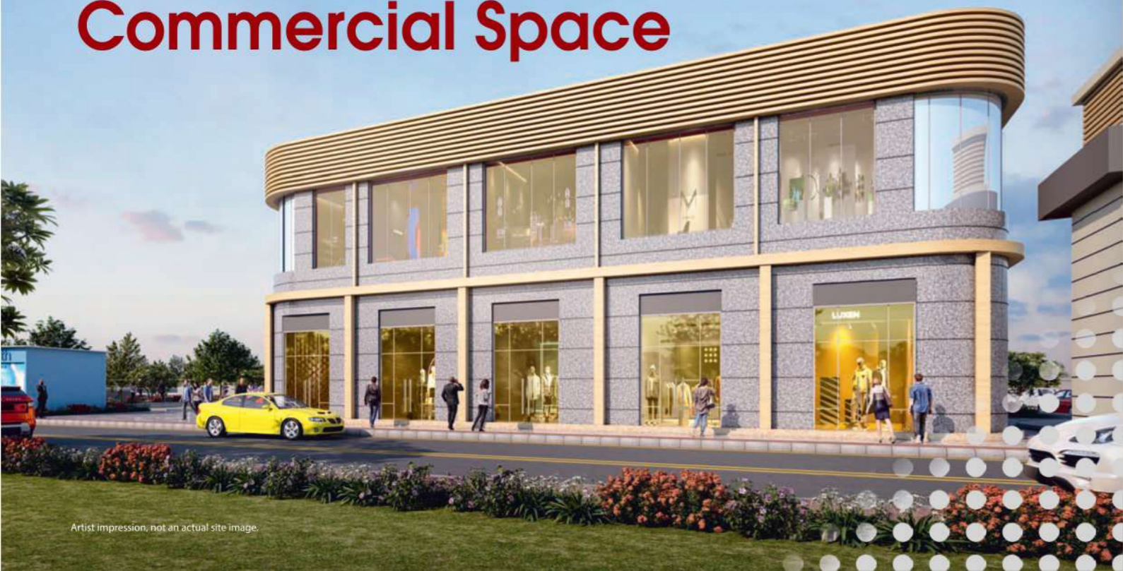
Artist impression, not an actual site image.