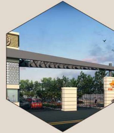
MODERN ENTRY GATE