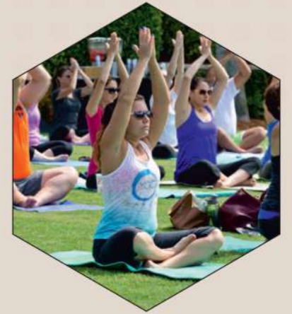
YOGA & CENTRAL PARK