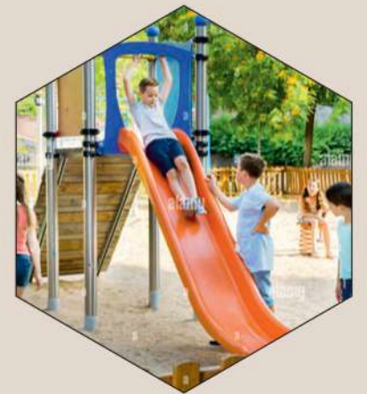
KIDS PLAY GROUND